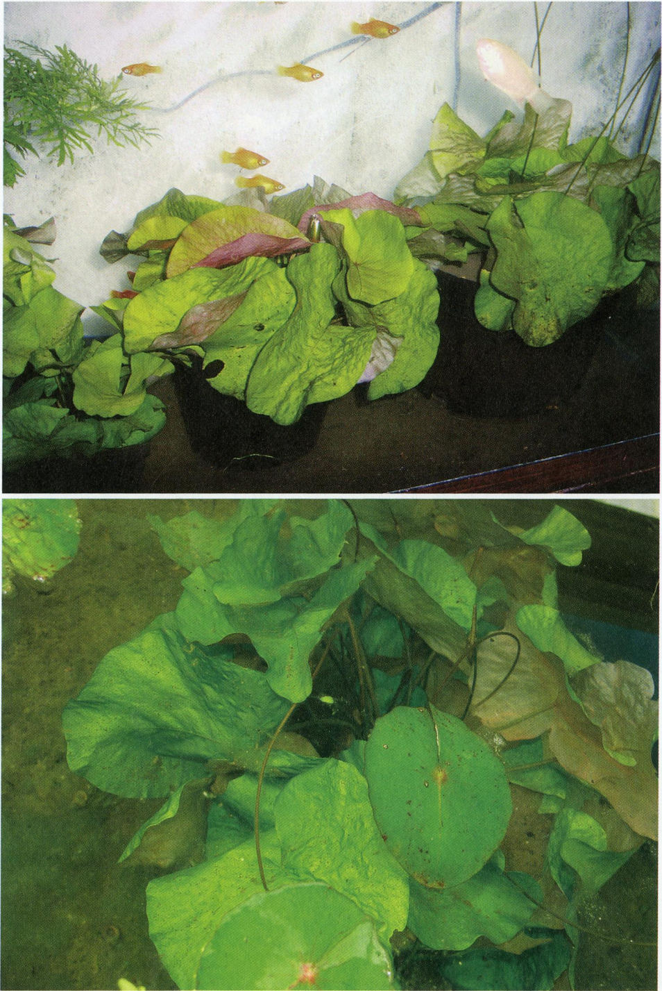
FIG. 3. Top, submerged plants under artificial light in an aquarium, not submerged bud on center plant. Bottom, submerged plant grown in pond under nature conditions in a tropical climate.