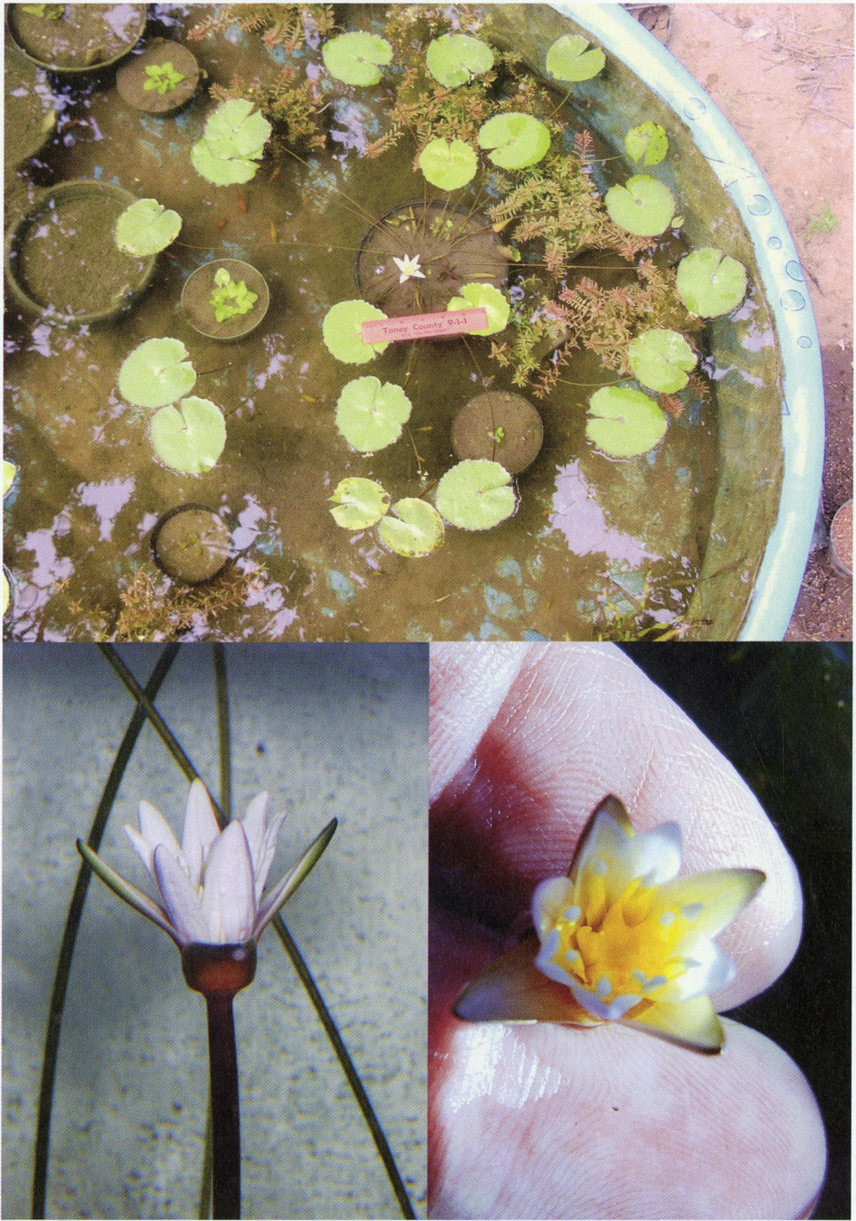
FIG. 4. Clockwise from top, mature Nymphaea minuta , emerged form with flower, ca. 60 cm wide; close up of flower showing stigmatic disk, carpellary styles and appendages on stamen; submerged flower fully open.